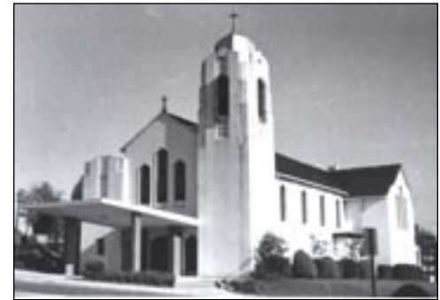
St Peter's was one of the first parishes opened in what is now the Lower Mainland.