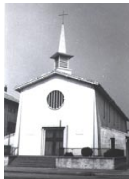
Sacred Heart (Vancouver) was the second parish to be created for the City of Vancouver.