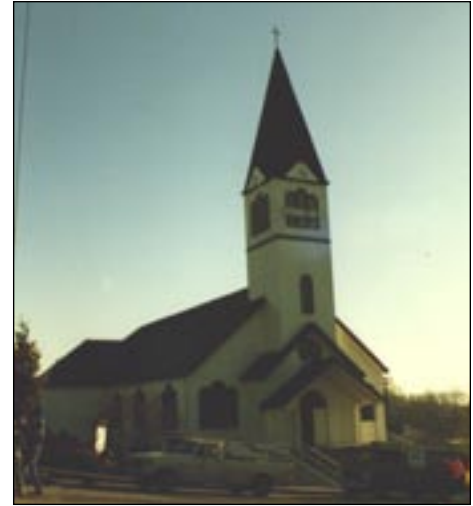
Our Lady of Lourdes was the first French parish in the Archdiocese of Vancouver.

Lay organizations include the Ladies of Ste. Anne (since 1917), Knights of Columbus (since 1949), Espiritu Cru (youth group), Legion of Mary, Outreach to Seniors, Pro-Life Prayer Group, Our Lady of Perpetual Help Prayer Group and World Apostolate of Fatima Prayer Group. The parish was served by the Oblates of Mary Immaculate (1909–1911), the Praemonstratensian Canons (1916–1948) and the Franciscans (1953–2002).