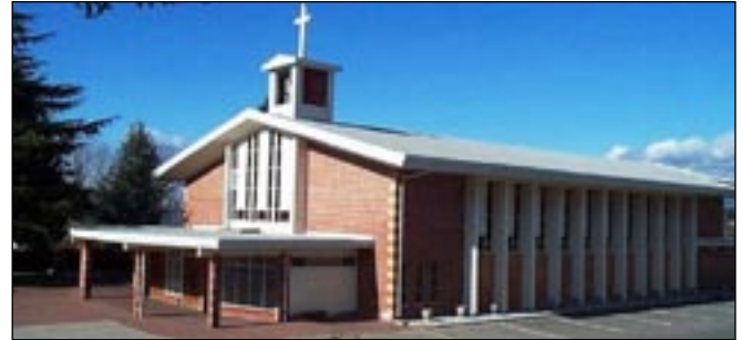
Church of the Assumption (Powell River) was originally named St. Joseph's. The name was unofficially changed in the 1960s.