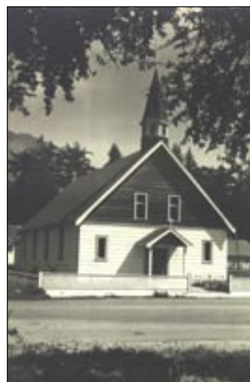
Our Lady of Good Hope was founded by the Oblates of Mary Immaculate in 1860 and a chapel was built at the corner of Park Street and Water Avenue.

Annual events include an outdoor Mass in the parish cemetery; Good Friday, Marian and Corpus Christi walks; a St. Patrick's Tea; and a fall dinner. Lay organizations include the Catholic Women's Auxiliary and Knights of Columbus.