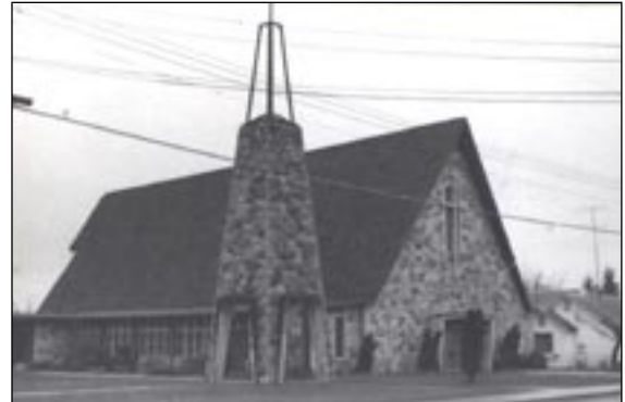
St. Mary's (Chilliwack) was initially an Oblate mission and the Oblates would come from New Westminster or from across the Fraser River at Mission to offer Mass.

The parish supports two missions, St. Theresa's (for the Yakwekwioose Band) and St. Mary Magdalene (for the Cheam Band). The parish also supports St. John Brebeuf Regional Secondary School in Abbotsford. In addition, the parish operates Mother Teresa's Place (a thrift store) and a weekly food bank available to parishioners and the community at large.