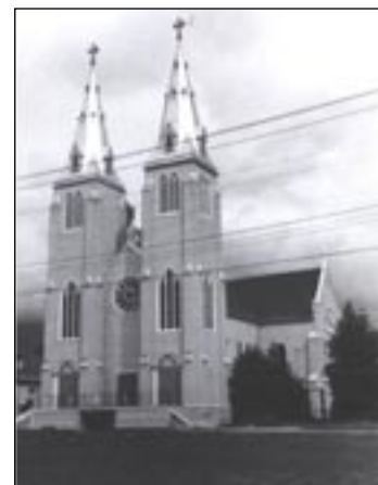
St. Paul's (North Vancouver) was renovated in 1910 during which time a second steeple was added.

The parish supports one mission, the Tsleil-Waututh Nation reserve, legally known as Burrard Inlet Indian Reserve No. 3. The parish has supported St. Paul's School and St. Thomas Aquinas Regional Secondary School. Annual events include a Christmas concert, a spring sale, and a bazaar. Lay organizations include the Save St. Paul's Society (1984–2004) and the St. Paul's Preservation Fund (established in 1987 to provide funds for major repairs as needed). The Oblates of Mary Immaculate continue to serve the parish.